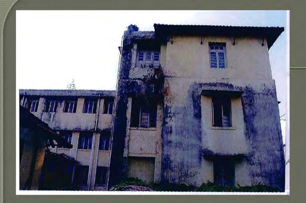
Initial stage of the hospital